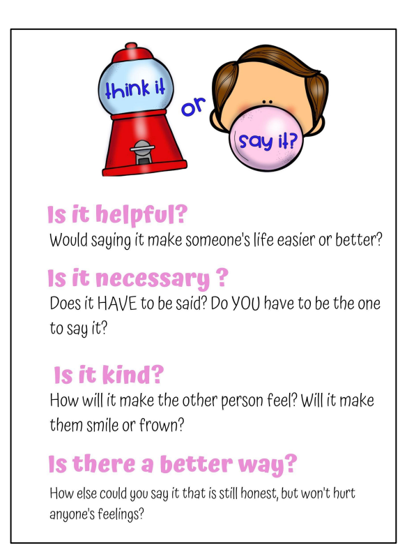
Classroom Lesson Handout